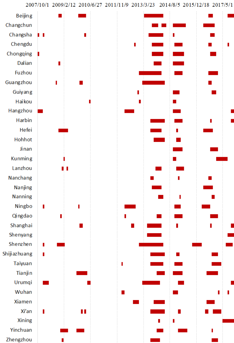
Figure 2. Timeline of housing bubbles across cities

find out that China's A-share market boom (between mid-2014 and mid-2015) seemed to follow the property market boom (with intense and long-lasting housing bubbles between mid-2013 and mid-2014). The logic seemed that investors retreated from the housing market after lock-in their profits (as housing bubbles had shorter durations since then) and shifted their capitals into the stock market.