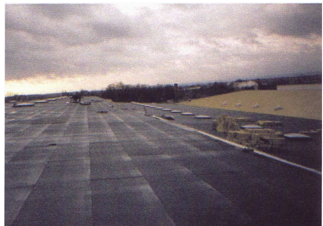
Fig. 1. The roof on the developed object Kunice

Optimization of realization process presented on the example of the construction works and models of works consists in a certain problem of tasks arrangement on machines, so-called permutational flow shop problem with a costs delay sum minimization. The optimal methods, concerning the NP-hard problems solution of