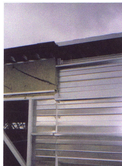
Fig. 2. Walls casing on the developed object Kunice