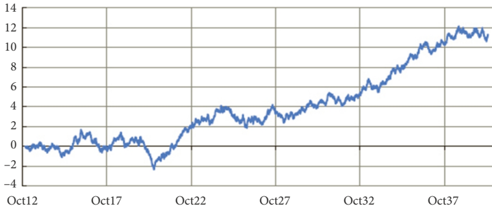
Figure 1. Random walk